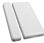
106-272 MICRO RADIO REED TWR