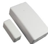
K-106-267 3 ZONE SENSOR TWR