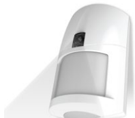
106-271 LUX RADIO PIR TWR