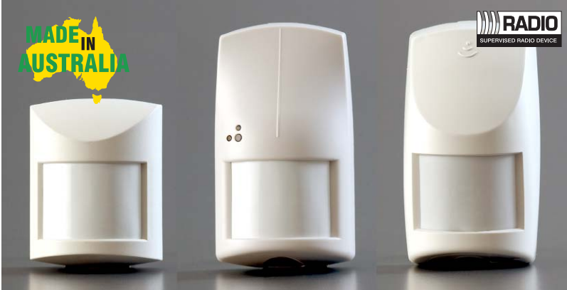
100-692 Ness Quantum™ Pet Aware PIR