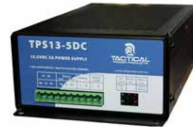
TPS13-5DC 13.5Vdc 5A Power Supply with Battery Charger