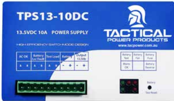
TPS13-10DC 13.5Vdc 10A Power Supply with Battery Charger