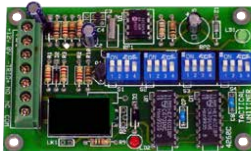
TIM-01 Universal Digital Timer