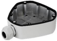
DS-1280ZJ-DM25 Junction Box