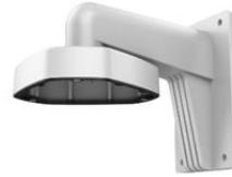
DS-1273ZJ-DM25 Wall Mount