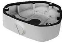
DS-1281ZJ-DM25 Inclined Ceiling Mount