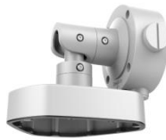
DS-1283ZJ Wall Mount (3-axis Adjustment)